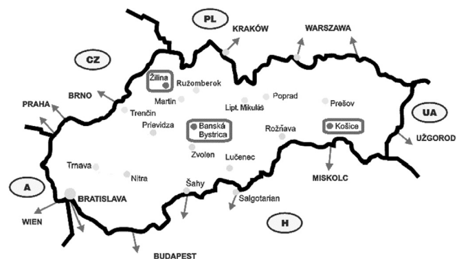
Fig. 1. A simplified map of cities selected for the study.

The samples were collected from roof runoff. All samples for the physicochemical parameters were taken as 24 h mixed samples, stored at 4 °C and processed within 24 h. Only selected physicochemical parameters were tested as microbiological parameters are not substantial for irrigation, maintenance, WC flushing, and